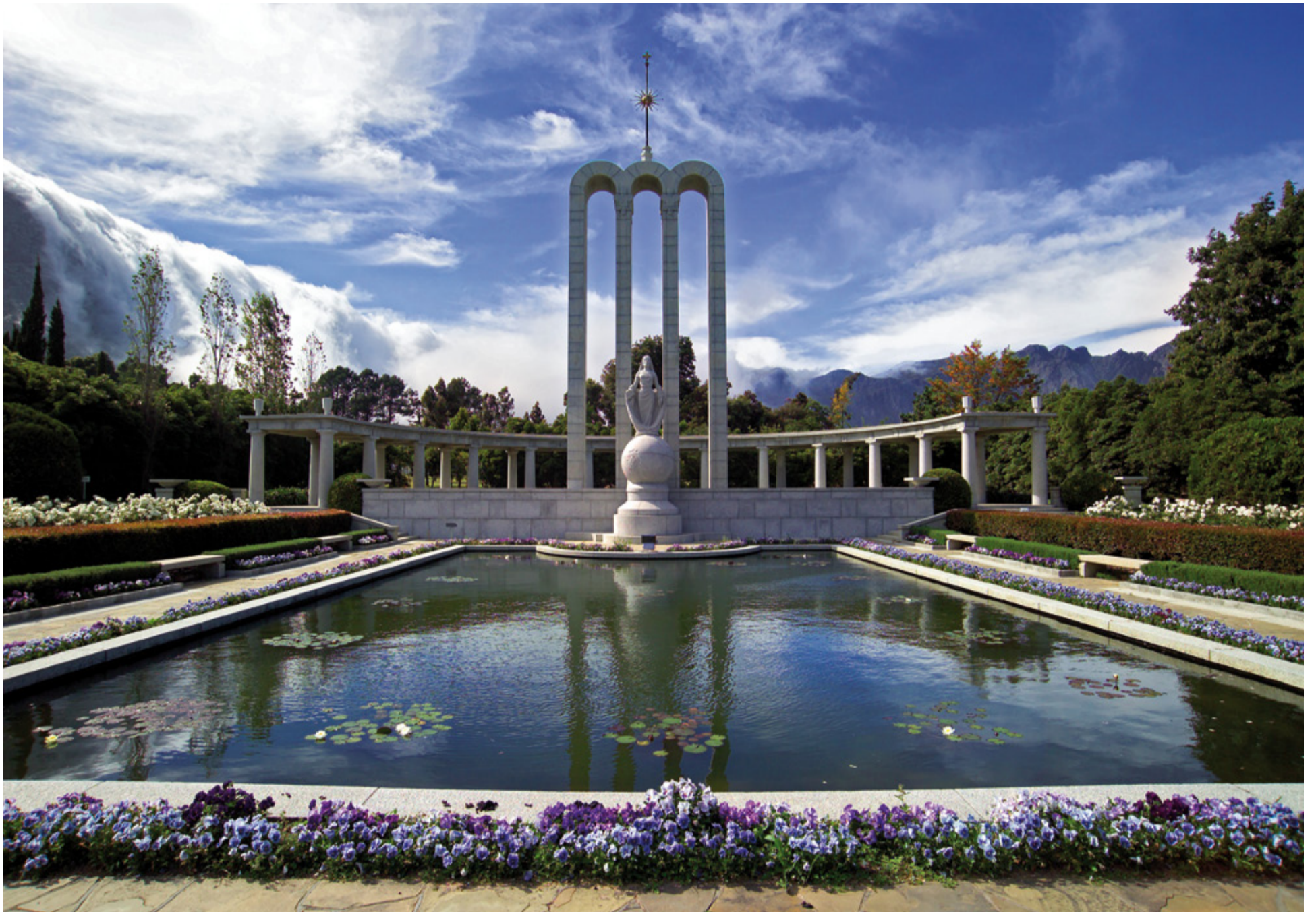
Huguenot Monument, Franschhoek

ART IN CLAY · HUGUENOT FESTIVAL · CLASSIC MUSIC FESTIVAL · OPEN GARDENS